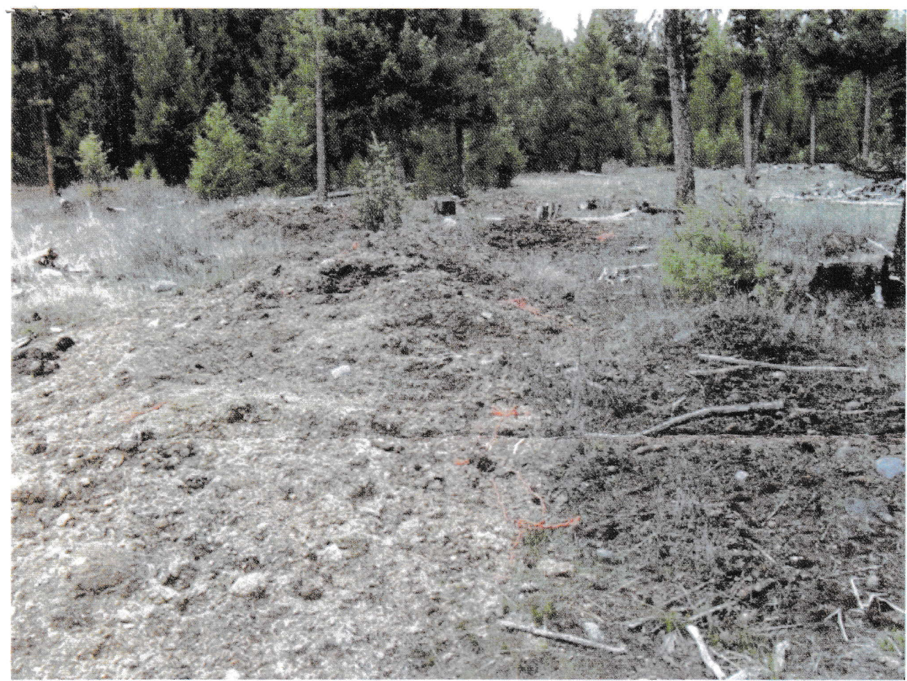
More baling twine mess