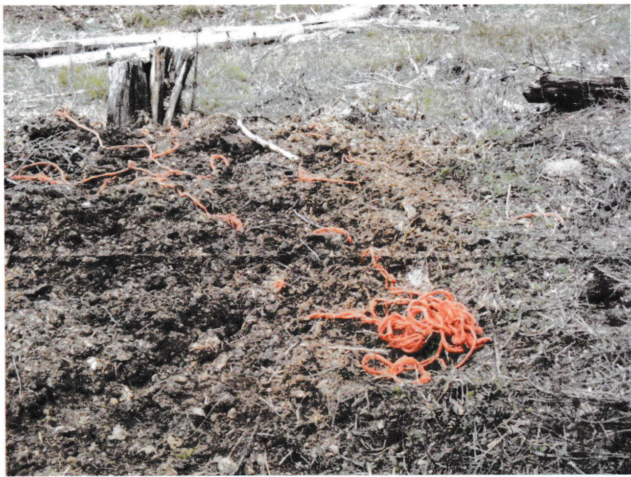
Baling Twine Mess